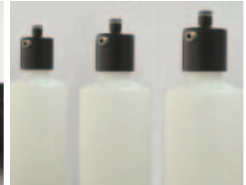
Prepare multiple bottles of fluid for use at one time.

The Evolution Injector™ combines a chemical cavity injector and Comfort Grip Trocar™ in one new product. Designed to bring the process down to one hand for advanced maneuverability.