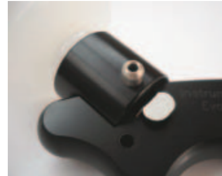
Quick release bottle attachment for easy bottle installation and removal.